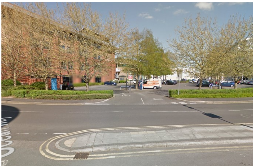
Ocean Village Berth Holder Car Park